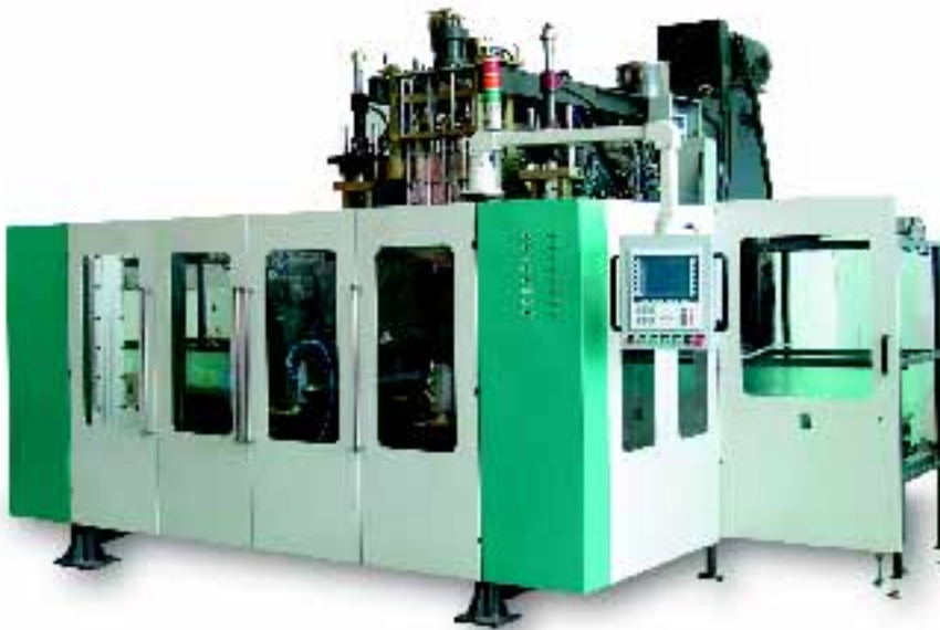
Double-station 20T Blow Moulding Machine

As for our other manufacturing businesses like plastic injection moulding and circuit board processing, we will continue to adhere to the same guiding principles and investment visions in updating our technologies, renewing our products and optimizing our management in a pragmatic and forward-looking manner to tie in with the latest needs of the market.