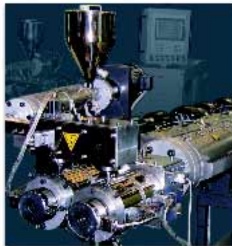
Double Strand Extrusion Line