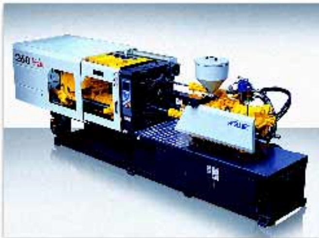
F2R High Precision, High Efficiency Injection Moulding Machine