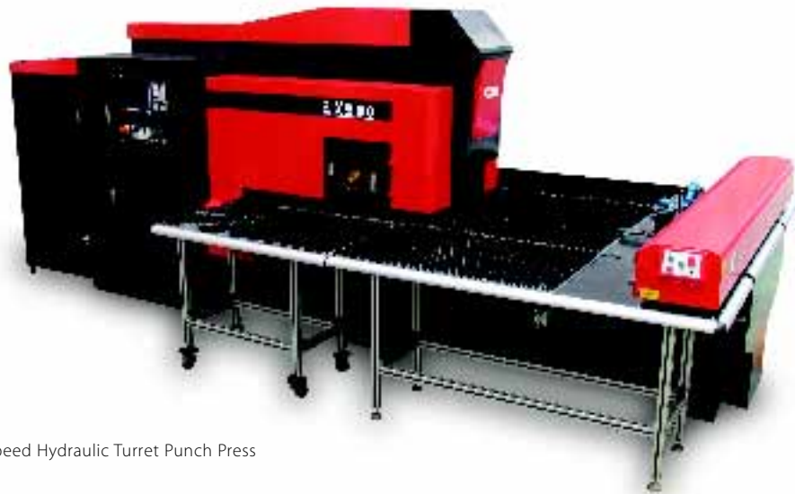
CNC High Speed Hydraulic Turret Punch Press

Adhering to our management principles and development guidelines of "industry-based, people-oriented, pragmatically aggressive, and continuous learning" during the year under review, our business continued to evolve around machinery manufacture and technological development. Our pursuits for product differentiation and quality perfection have gained for the Group a strong footing in the market. In 2005, hi-tech products catering to the needs of customers were successively launched and were well received by the market. The additional business thus generated not only compensated the ebbing sales of standard series as impacted by unregulated price wars but also served to reaffirm the technology-led strategy we have been pursuing for product development. With apt market strategies