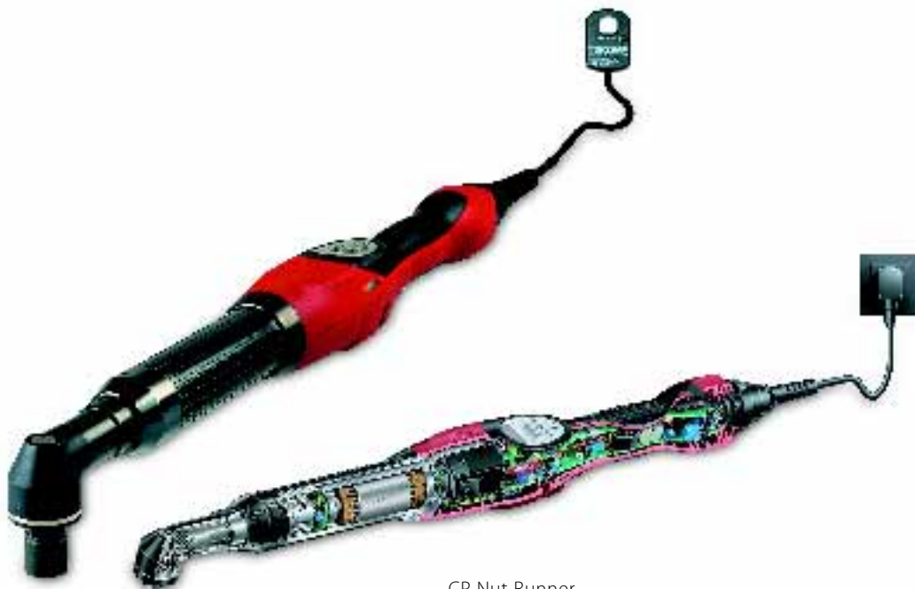
CP Nut Runner

During the year, the processing and manufacturing industries were hard hit by soaring costs as a result of consistently high prices of raw materials like metal and plastic. As our customers readjusted their production and procurement plans, the performance of our trading business experienced a sharp fall in the first quarter. Furthermore, climbing production costs also ate into our profit. Faced with intense competition in the market, the Group remained adamant with our strategic plan to secure for our selective products a bigger share in our target markets. Performance began to improve in the second quarter, to be followed by a more significant growth in the latter half of the year as the high material prices were gradually absorbed by the market and breakthroughs were made for some of our new products.