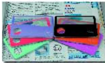
Credit Card Size illuminated fresnel magnifier 2x 4x, with LED

Equipped with a fully enclosed clean room built in accordance with international standards and complete with injection, printing, packaging and mould making facilities so that the entire process from product design to batch production can be carried out in-house, our factory in Zhuhai specializes in plastic injection products like sanitary plastic tableware and food packaging.