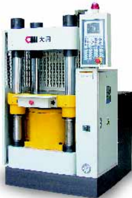
CMSX Series Computerize Four-Column Hydraulic Press

As for prospects in 2006, the Mainland, as the world's factory and a vibrant economy, is expected to witness rise in both investment and domestic spending. Intentions to invest in plastics processing and sheet-metal working machinery will improve when prices of plastic resins and steel stabilize. In anticipation of the likely accelerated growth of the Mainland market for medium to up-market injection moulding machines, we will scale up the production of these series at our plants in Wuxi, China, in collaboration with Japan UBE Industries Ltd to meet market needs. Turning to our other products, fully closed-loop plastic injection moulding machines, high speed CNC turret punch and high productivity multi-layer blow-moulding machines are expected to sell significantly better than in 2005. All in all, although competition will remain fierce, the Group is cautiously optimistic about the outlook of its machinery business.